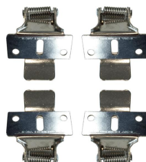
140053150 LEDPanelRc-Sl-E Mounting-Springs